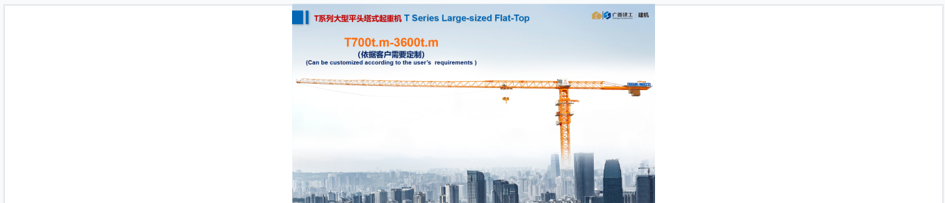
Overview of T-Series customization options and lifting capacity ranges.