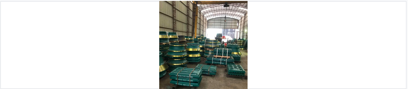
Securely packaged wear parts ready for global transit.