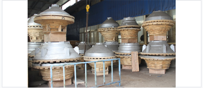
Durable manganese steel composition ensures long service life in crushing applications.