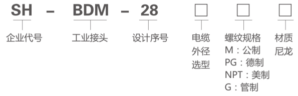
Reference chart for identifying thread standards and model sizing.