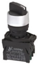
Standard Handle Selector Switch