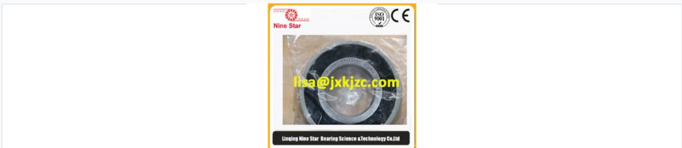
Precision-engineered insulated bearing designed to prevent electrical erosion in motor applications.

High-Performance Insulated Bearings These deep groove ball bearings are specifically engineered for electric motors to prevent electrical erosion and current leakage. By utilizing advanced insulation technology on either the inner or outer ring, they protect against bearing damage caused by electrical discharge, significantly extending motor lifespan. Designed for high-speed operation and heavy loads, these bearings ensure reliable performance in demanding industrial applications such as power generation and manufacturing.