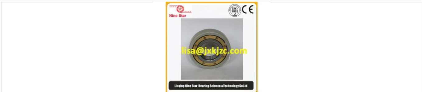
The robust construction ensures smooth operation and extended service life under demanding conditions.