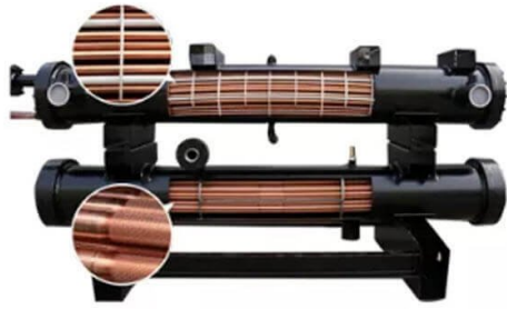
Robust shell and tube heat exchanger for efficient thermal transfer.