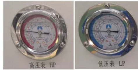
Precision pressure monitoring for system diagnostics and safety.