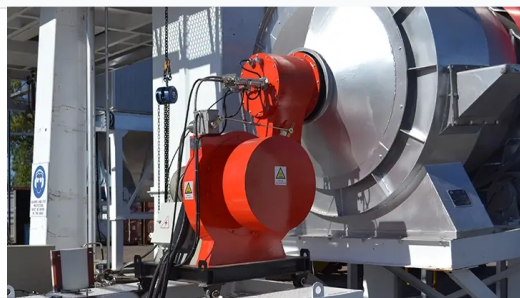
Industrial oil burner unit featuring a cylindrical combustion chamber and twin-blower assembly, mounted on a mobile platform.