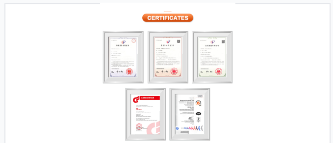
Key features including 4G LTE blocking and detachable signal amplifier.