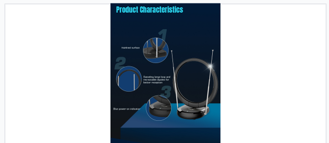
The hairlined surface finish and blue power-on indicator provide a premium aesthetic.