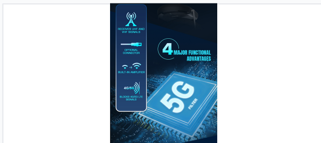
Key advantages including built-in amplification and 5G LTE signal filtering.