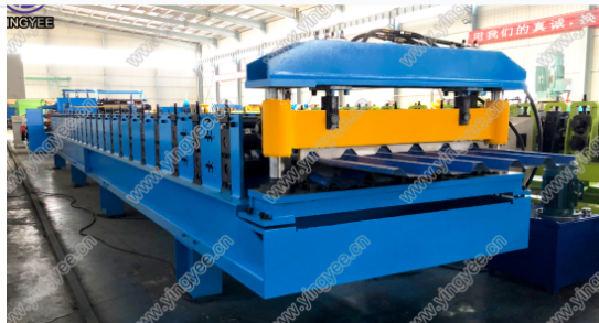
The complete production line featuring heavy-duty construction for continuous operation.