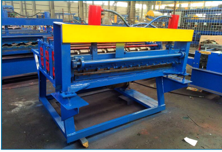
Detailed view of the hydraulic system, rollers, and adjustable blades.