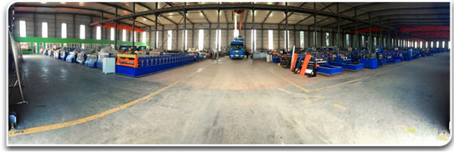
The machine integrated into a production line for high-volume metal sheet processing.