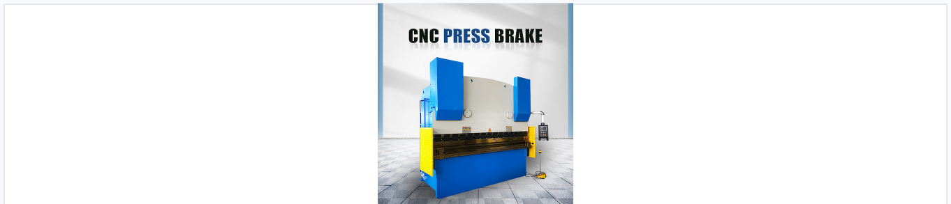
High-safety hydraulic CNC press brake designed for precision metal forming.