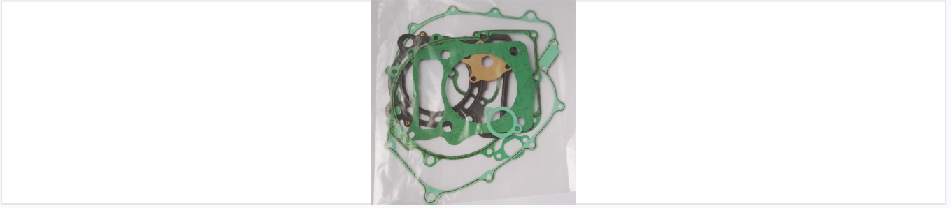
Detailed view of the gasket components included in the full engine rebuild kit.