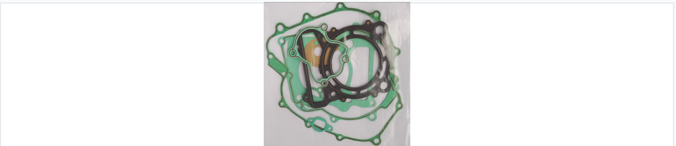
A complete set of gaskets designed for 500cc engine rebuilds, ensuring reliable sealing for ATV and UTV applications.