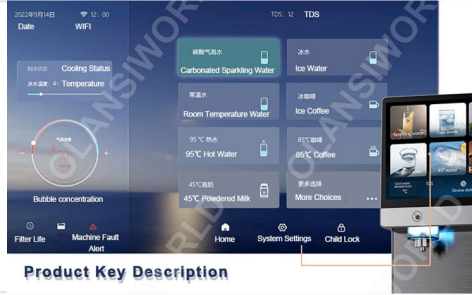
Product Key Description