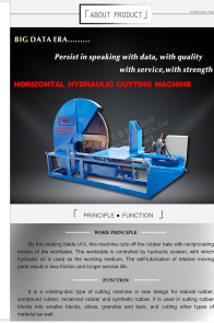
Illustration of the hydraulic system and rotating blade cutting principle.