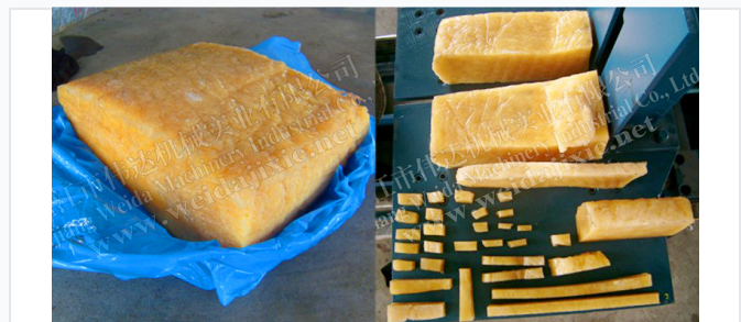
The horizontal cutting machine setup designed for efficient rubber material size reduction.