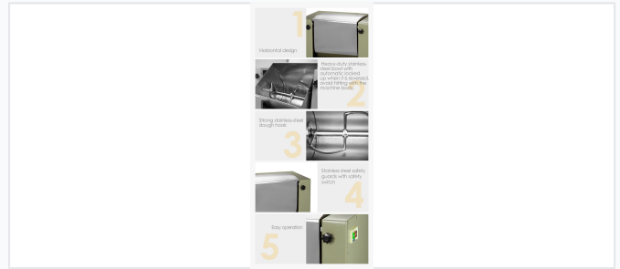
Heavy-duty stainless steel components designed for consistent dough mixing.