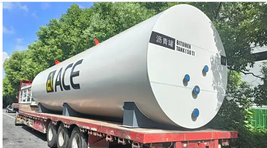
Horizontal bitumen tank featuring a 50T capacity, designed for mobility and efficient site placement.