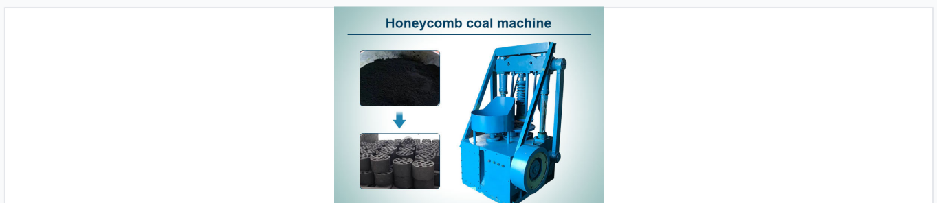
A robust honeycomb coal briquette machine designed for high-efficiency production.