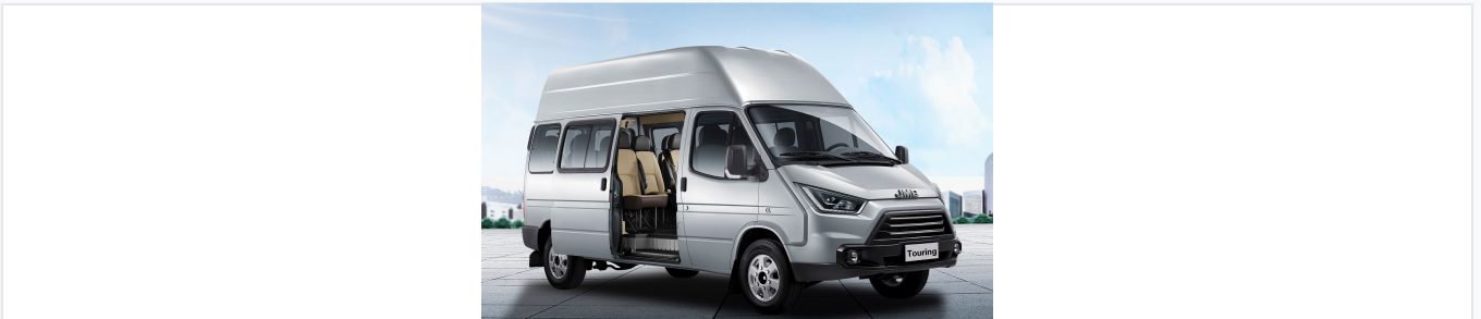
Classic yet modern exterior styling.