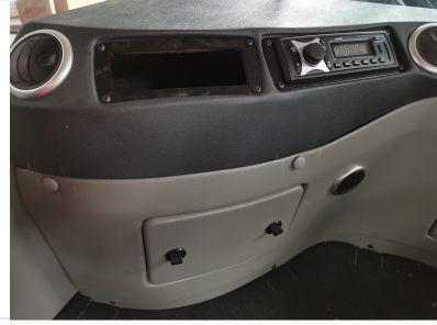
Dashboard assembly featuring integrated air vents, digital audio system, and storage compartments.