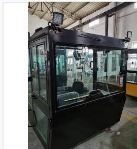
Cabin door assembly with heavy-duty hinges and handle for easy access and security.