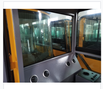
Interior view highlighting ergonomic design and ventilation system integration.