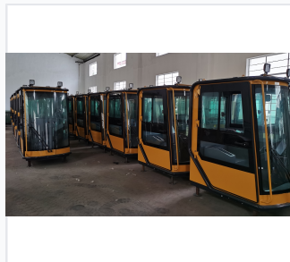
Fully enclosed cabin design featuring integrated safety glass and pre-wired electrical provisions.