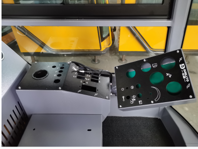
Detailed view of the control interface panel with ergonomic layout and instrumentation openings.