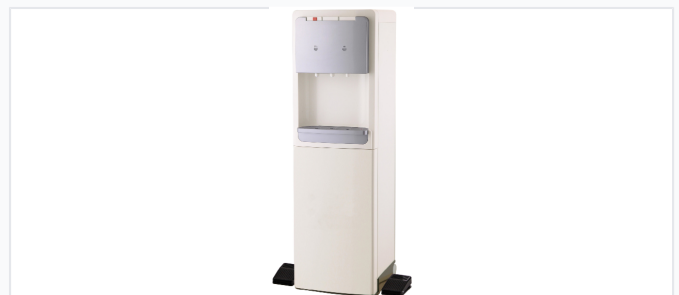
Includes a convenient bottom cabinet and removable drip tray for easy maintenance.