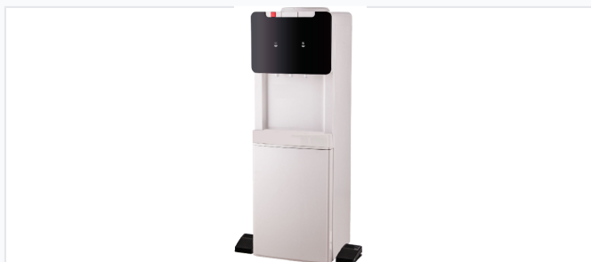
Sleek, modern design with separate pedals for hygienic water dispensing.