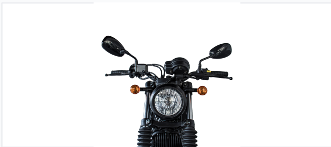
A classic bobber silhouette designed for urban agility and style.