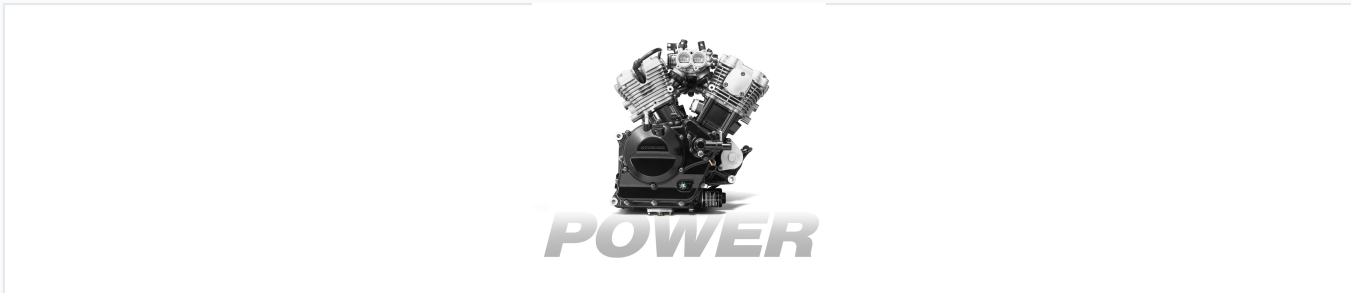
Liquid-cooled 60° V-twin engine built for reliable power and performance.