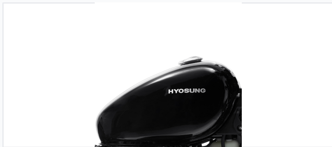
Distinctive bobber-style fuel tank design.