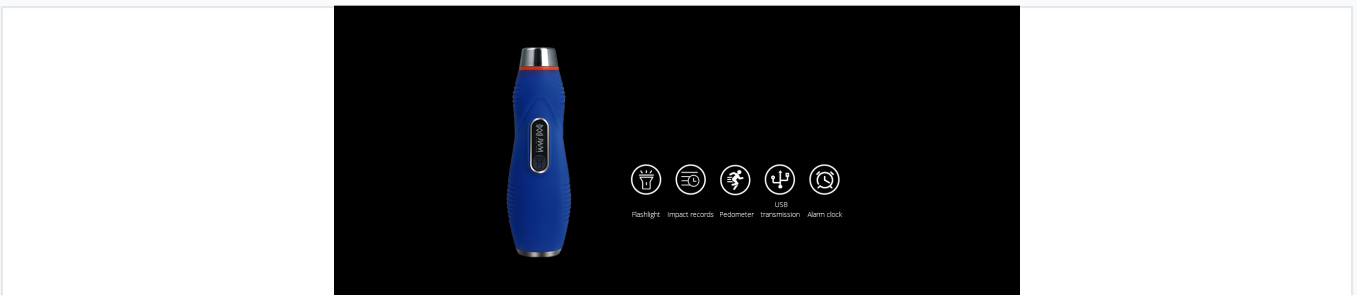
A multifunctional device integrating flashlight, impact recording, and data transmission capabilities.