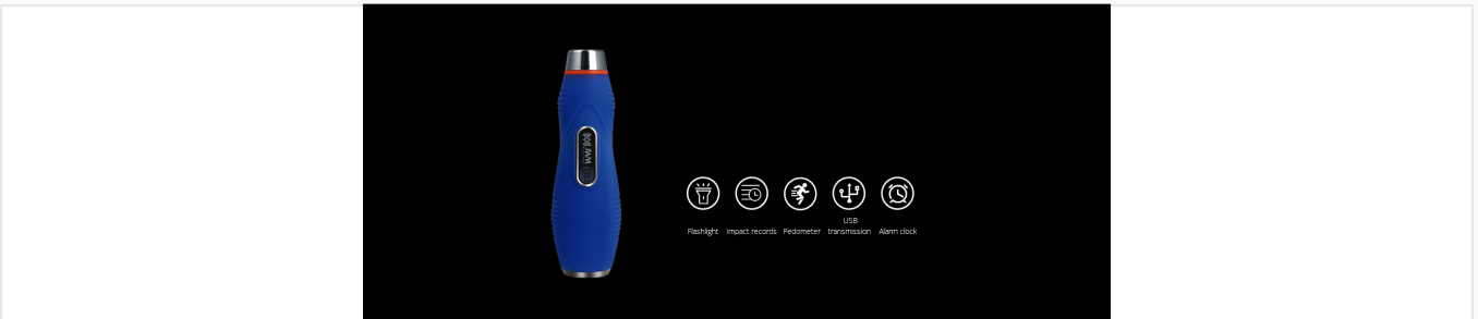
Multi-functional device featuring integrated flashlight, impact records, and pedometer.