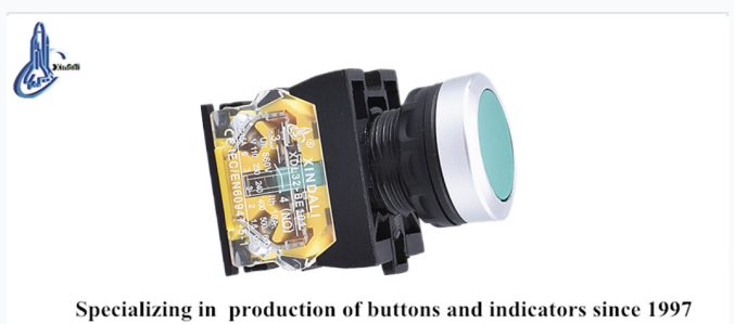
Green flush head design showing robust contact mechanism and standard environmental resilience.