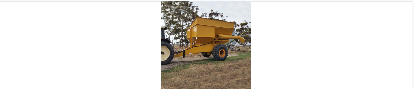
A yellow grain cart featuring a large hopper and discharge auger, designed for efficient harvest material handling.