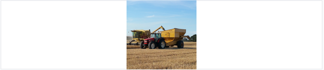
Operational view of a grain cart receiving crop from a combine harvester, demonstrating efficient field transport.