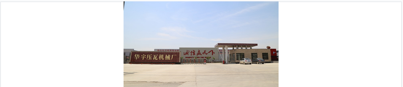
Industrial-grade roll forming machine for high-volume roofing panel production.