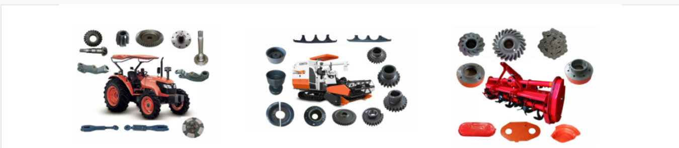
Precision-engineered components designed for reliable agricultural machinery performance.