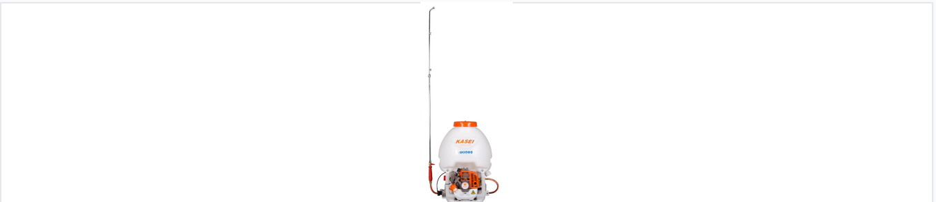
Backpack power sprayer featuring a large-capacity tank and ergonomic design for efficient agricultural spraying.