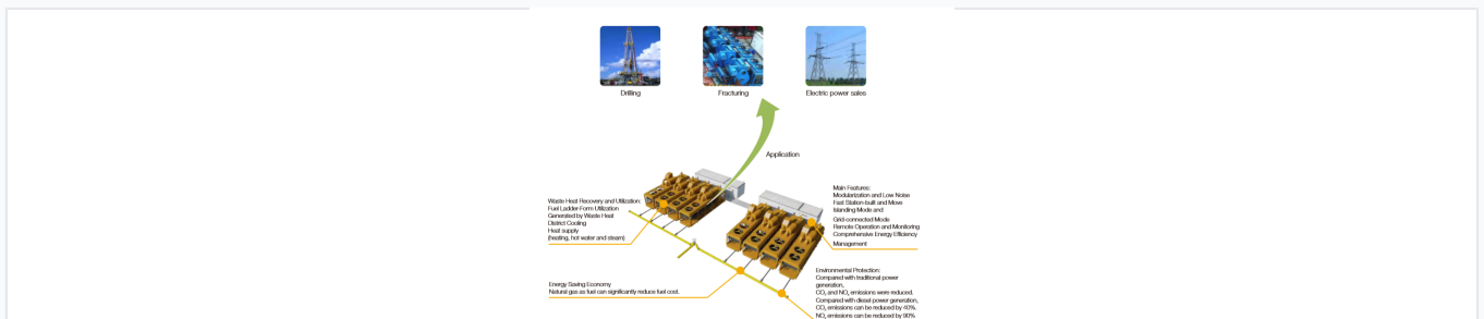
Overview of modular design, environmental benefits, and waste heat recovery capabilities.