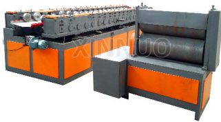
XN GARAGE DOOR ROLL FORMING MACHINE

Complete production line featuring decoiler, leveling unit, roll forming section, and cutting unit.