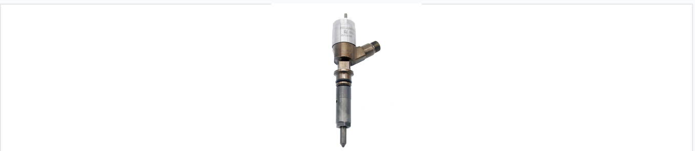
Precision-engineered fuel injector assembly for CAT C6.4 engines.