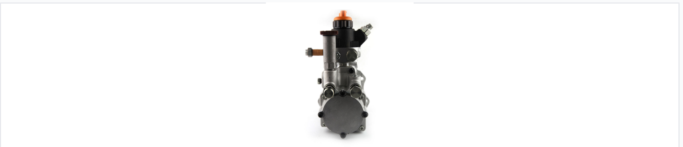
Precision-engineered fuel pump 094000-0383 for Komatsu PC400-7 and PC450-7 series.