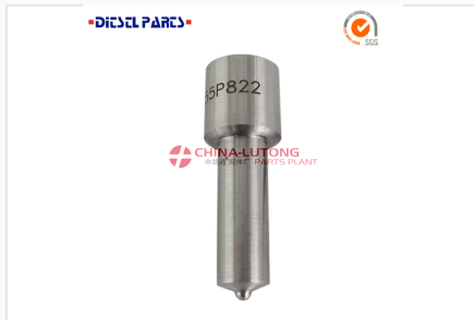
Precision-engineered nozzle designed for optimal atomization.