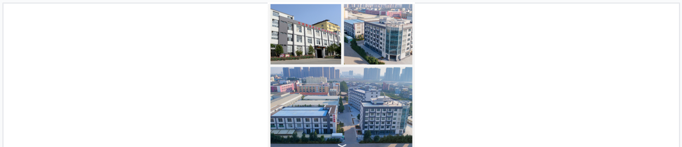
High-performance nozzle component ensuring efficient combustion and reduced emissions.