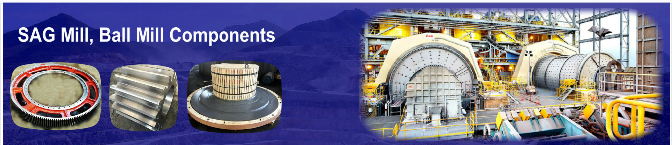
High-density grinding media and mill components suitable for SAG and Ball Mill operations.