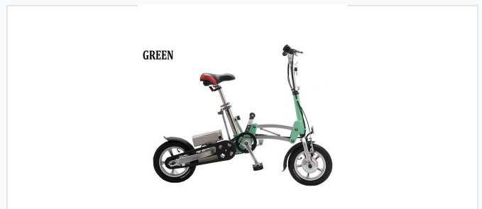
The bike in its green colorway, highlighting the compact folding design.