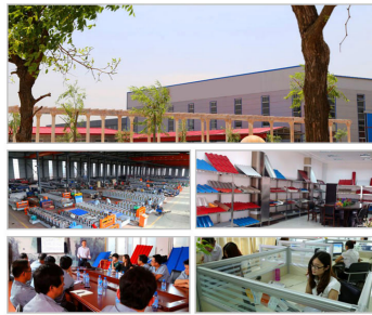
Automated equipment for consistent and reliable tile manufacturing.