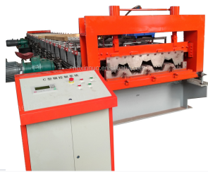
Robust machine frame with integrated digital control system for precise adjustments.