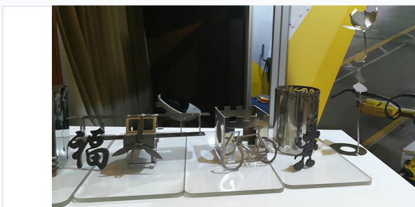
Diverse metal art samples demonstrating the versatility and precision of the fiber laser technology.