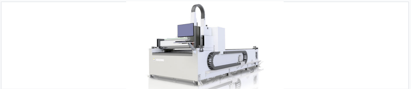
Industrial fiber laser cutting machine featuring a robust frame and advanced automated control system.