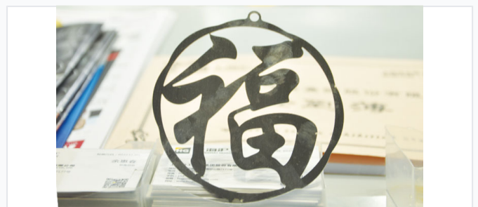
A decorative metal ornament featuring a traditional Chinese character, highlighting clean edges and intricate detail.