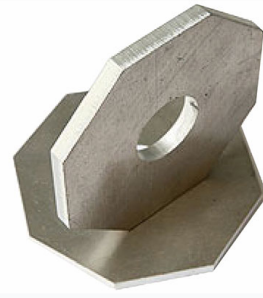
High-quality output showing the clean, accurate edges typical of this fiber laser system.