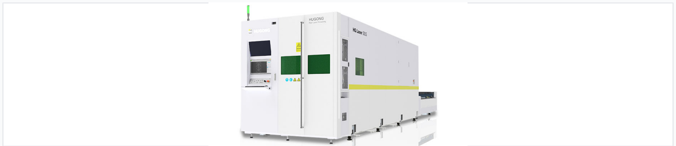
The fiber laser cutting machine features a compact, modular design optimized for industrial metal processing.