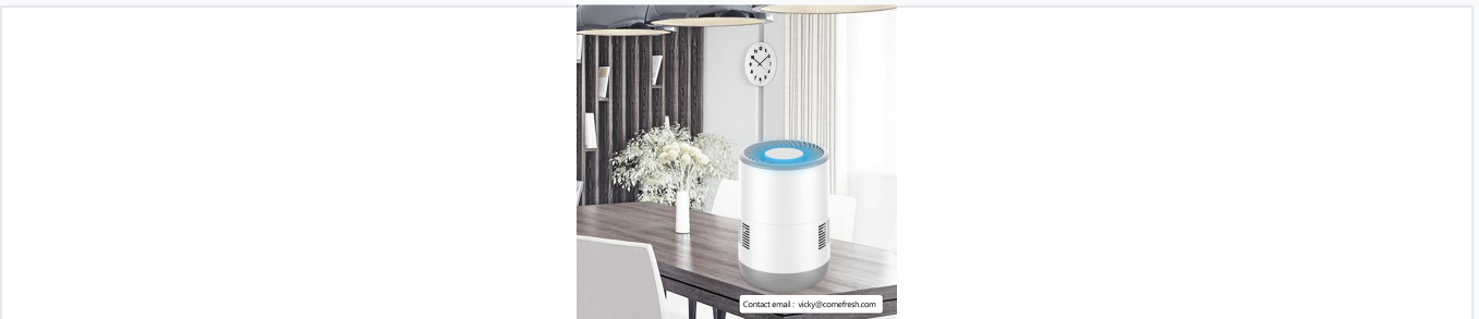
Concise cylinder design well integrated in modern decoration.