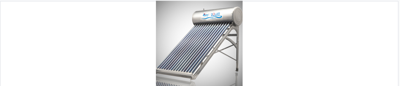
Solar water heater setup suitable for various climates and residential applications.