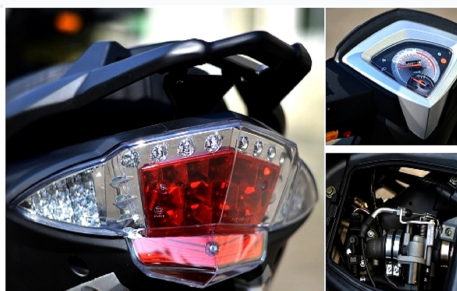
Integrated tail light assembly for enhanced visibility.