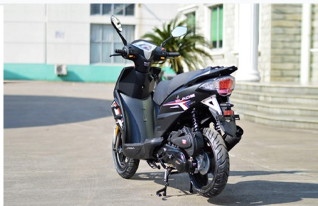
Designed for comfort with practical under-seat storage.