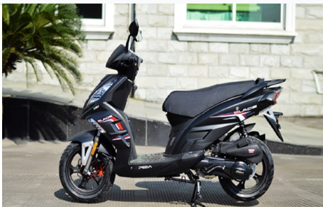
Modern styling with integrated lighting systems.