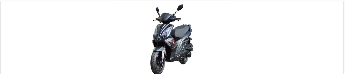
Aerodynamic design optimized for urban efficiency.