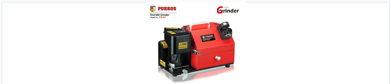
Precision grinding tool for sharpening end mills with high accuracy.