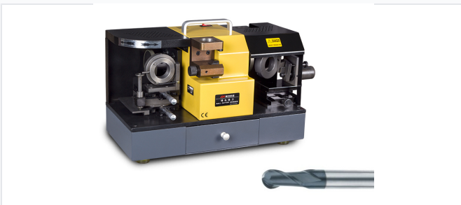
Specialized grinder for precision sharpening of ball end mills.