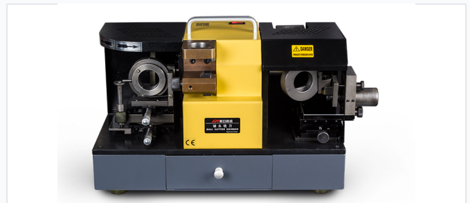
Robust construction designed for stability and consistent grinding results.