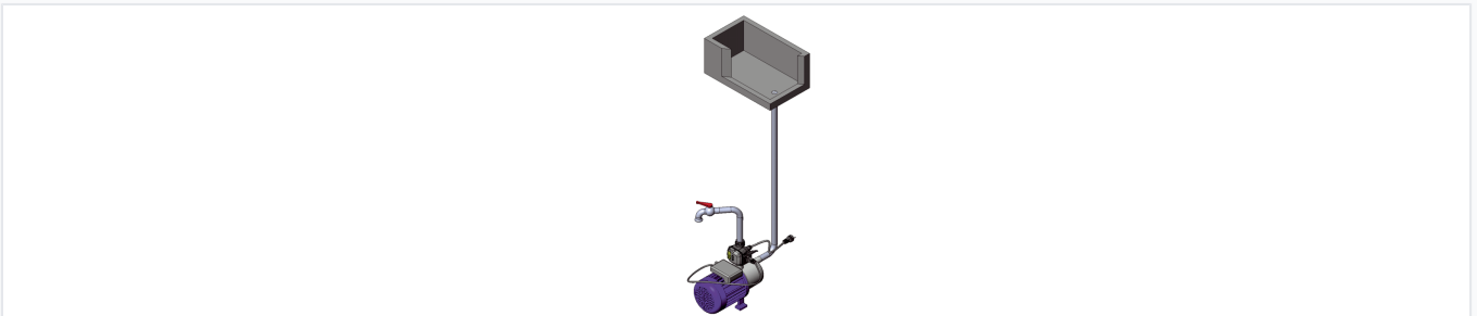
Typical installation of the flow switch within a booster pump system.