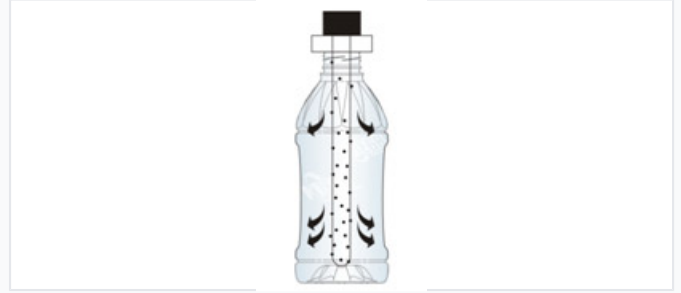
Illustration of the blowing process, highlighting the air recovery system which reduces production costs by recovering up to 30% of exhausted high-pressure air.

Toggle-designed clamping system with double-sided pneumatic compensation to ensure consistent parting lines.