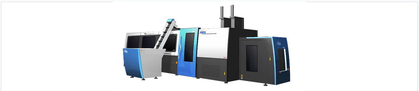
Linear designed electric stretch blow molding machine featuring high-speed clamping and efficient preform heating.