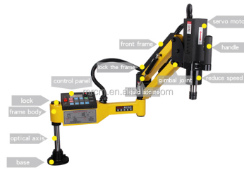
Detailed view of the servo motor, gimbal joint, and user-friendly control panel.